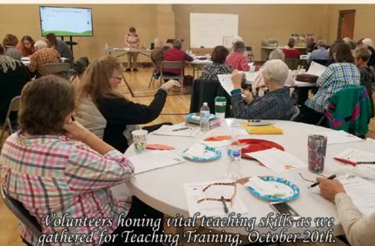
Volunteers honing vital teaching skills as we gathered for Teaching Training, October 20th.

Nearly 800 Bibles have been distributed to our Happy Day Club children in our first month of club. As the Word of God goes forth in teachings such as the Wordless Book, our first lesson series, we pray for hearts to come to Jesus. One club reported 7 decisions to follow Christ this week. God's Word is powerful! Mark Twain was once quoted as saying, "Most people are bothered by those passages of Scriptures they do not understand, but the passages that bother me are those I do understand." CEM is thankful for biblical lessons that are faithfully taught and made understandable through the Holy Spirit! We thank those of you who have given specifically to our Bible fund so that the Word will be freely given. We also praise God for the French New Testaments that are being distributed in TOGO.