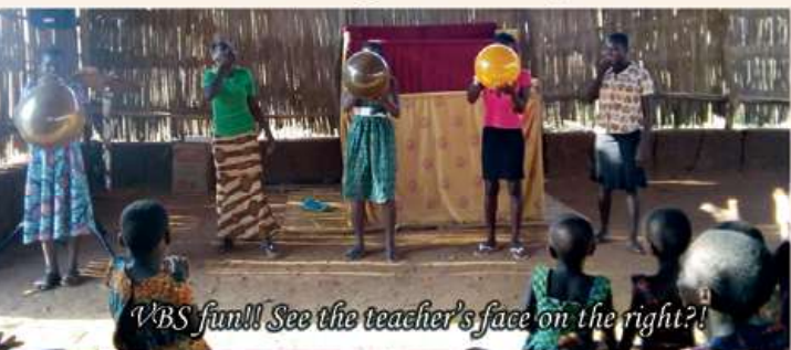
VBS fun!! See the teacher's face on the right?!

Our team in TOGO was asked to help you, our readers and supporters, to know what God taught each of the team members during the ministry of VBS this summer. Let's praise God for these thoughts shared: