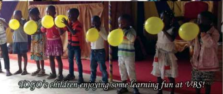
TOGO's children enjoying some learning fun at VBS!