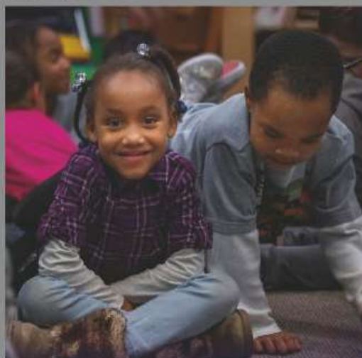
“I love Happy Day Club!”