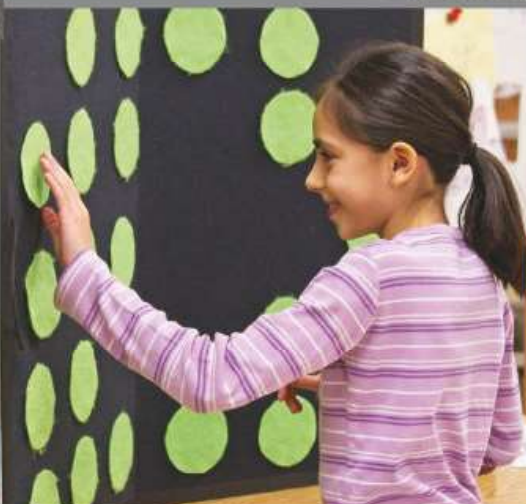
Playing review games is so much fun!