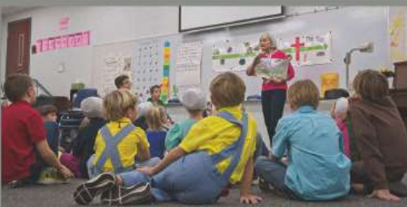
All children, no matter the culture, no matter the race, need to hear about Jesus!

“Do all the good you can, By all the means you can, In all the ways you can, In all the places you can, At all the times you can, As long as ever you can.” John Wesley, Founder of the Methodist Church