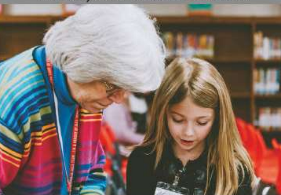
Sharing the Word of God with Happy Day Club students!